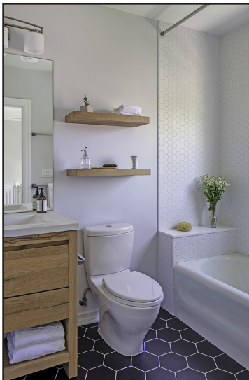
After bathroom renovation