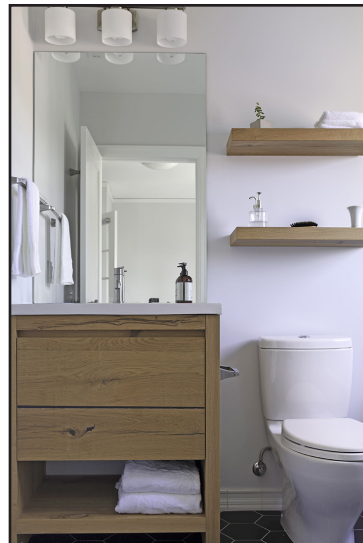
Bathroom finish designed with reclaimed oak.

costs between 20–35% of your total budget.