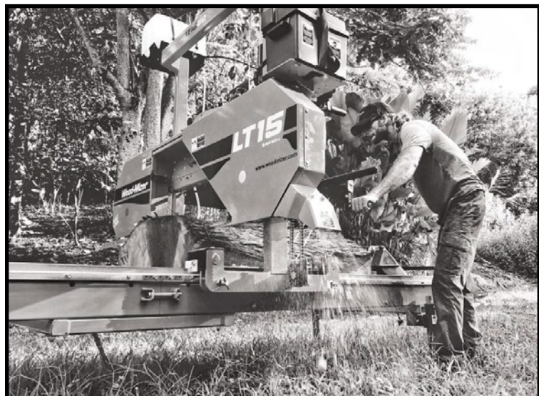
Custom wood countertop cut by Revival Woods of Kapa'au, Hawaii.

Because our goal was to remain within the footprint of the existing bathroom, we had to be creative with the space we had. We shifted the layout of the bathroom, repositioning the original bathtub and relocating the toilet using a wall-mounted tank behind the door. This gave us additional valuable square footage and made space for the statement piece of the bathroom - a custom wood countertop and shelves sourced from our client's family member, Revival Woods of Kapa'au, Hawaii.