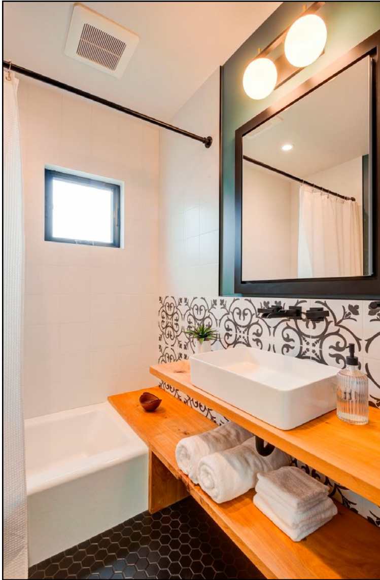
Bathroom refresh with natural countertops and bold backsplash.

The driving factor of our design was to maintain the existing architectural details of the house, while infusing our client's personal style – a blend of modern and vintage – with an appreciation for unique natural handmade materials. We collaborated closely with our clients who wanted to incorporate an organic and natural form of wood into the bathroom. That became the source of our inspiration and a focal point for the bathroom. Open shelving and natural elements also create a sense of openness in tight spaces.