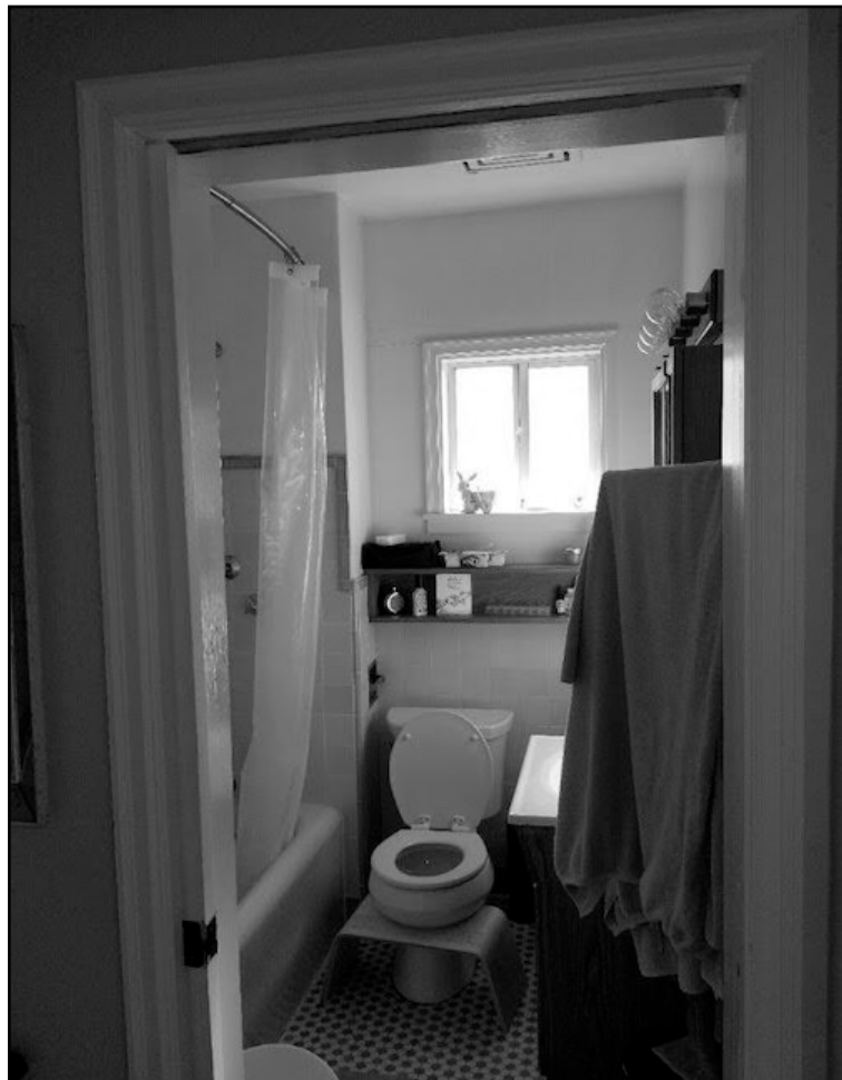
Bathroom before refresh.