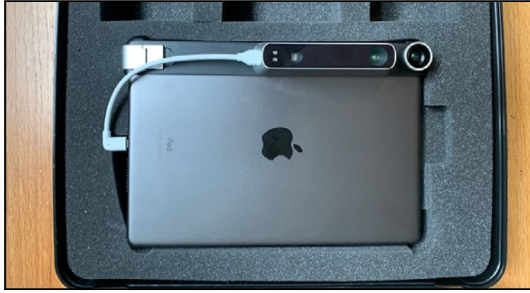
iPad equipped with a special 3D camera.

Here’s where residential remodelers are putting a new digital toolkit to work. A sanitized iPad equipped with a special 3D camera has been a saving grace for home walkthroughs. With easy-to-follow instructions on